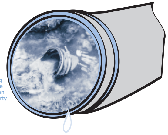
Overflowing cleanout pipe located on private property

Always notify your city sewer/public works department or public sewer district of sewage spills. If the spill enters the storm drains also notify the Health Care Agency. In addition, if it exceeds 1,000 gallons notify the Office of Emergency Services. Refer to the numbers listed in this brochure.